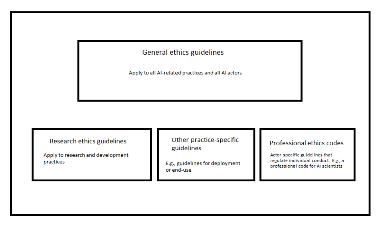
Fig. 1 Types of ethics guidelines for AI

Research ethics guidelines, in contrast, typically do not apply to individual conduct but to research and innovation practices.<sup>10</sup> These practices often involve multiple researchers, and it is not their individual conduct that the guidelines are directed at, but the overall way in which the research is conducted. These guidelines are typically not only used by researchers themselves, but also by research ethics committees that assess research. Research ethics committees typically do not do this during or after the research activity, but prior to it, on the basis of a research plan or proposal. Whereas the research ethics frameworks are general and provide rules and regulations to make sure studies are conducted in an ethical manner, a research proposal outlines what steps will be taken in a specific study. Research ethics committees then assess whether the research proposal adheres to relevant ethical standards or guidelines. Researchers usually make use of a self-assessment tool which contains a template for carrying out an ethics self-assessment that is then submitted to a REC, which proceeds to do its own assessment that draws from information in the self-assessment. Research ethics guidelines may either be separately incorporated into the self-assessment tool for researchers and a separate internal research ethics framework for RECs, or there may be a shared research ethics framework that guides both the researchers and the assessors.