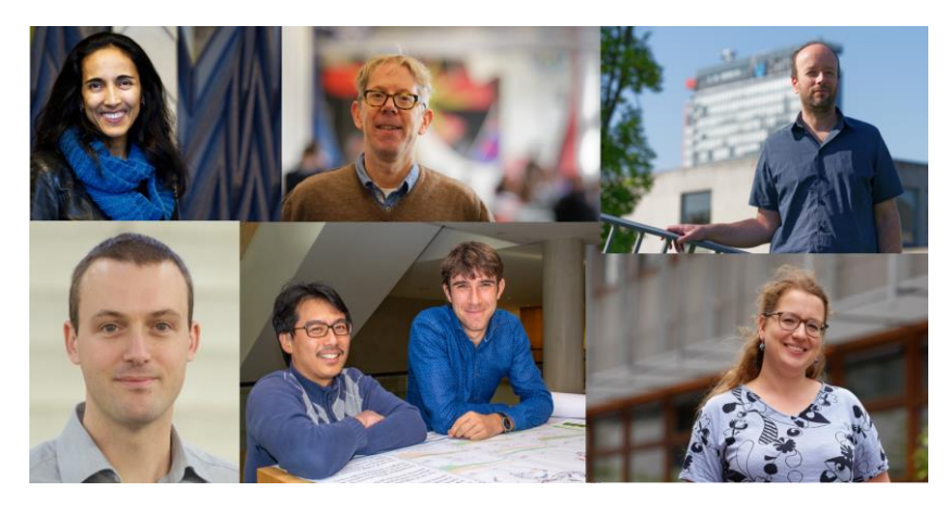
Profiled <u>Researchers</u> who use 4TU.ResearchData's data management & publishing services.

In 2019, a series of interviews was conducted with researchers who use the services. These showcase interviews provide an insight into the many, bespoke, ways in which ResearchData supports researchers in the management of datasets for their projects and their research groups according to FAIR principles.