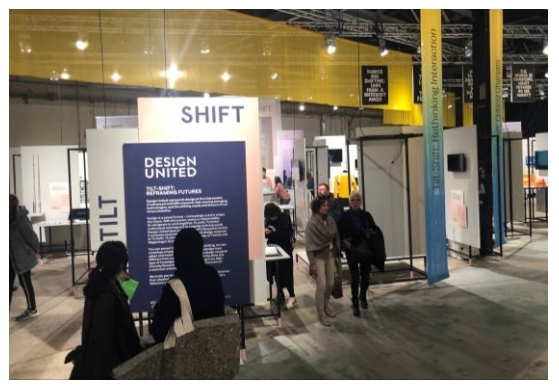
Design United exhibition in 2019