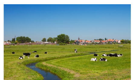
Figure 2.2. Typical Noord-Holland Noord landscape