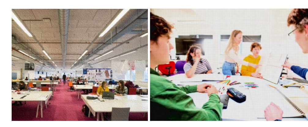
Figure 1. Typical TU Delft IDE/ABE design studio situation for undergraduate students

Teaching (physical) design skills in small studio groups of 10-25 engineering students has long been one of the main building blocks of the engineering curriculums at the TU Delft, in particular in the fields (and faculties) of Industrial Design Engineering (IDE) and Architecture & the Built Environment (ABE). The small group teaching approach in design education brings many advantages, such as community building between students (and mentors), student commitment, student engagement, and student visibility. The design studio is a stimulating and activating learning environment (Lawson & Dorst, 2009; Ghassan & Bohemia, 2015; Van Dooren, 2020) (Figure 1). It is the physical place where students get together many hours during the week to work on their individual and/or group assignments and projects. It is also the physical place where the students meet their tutors¹ for discussion, feedback, review, and assessment.